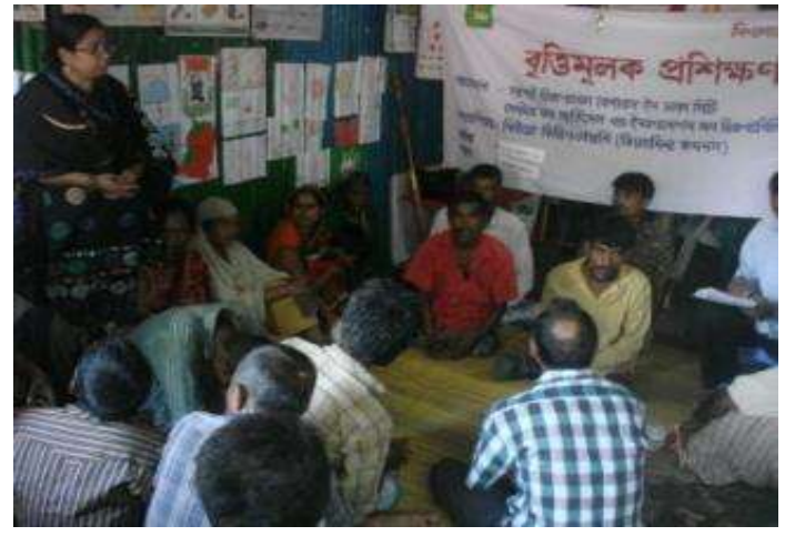
Providing Vocational Skill training

Support for initiate self-employment though vocational skill training and providing capital.