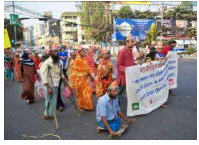
Beggars participating in on National Disability Day rally