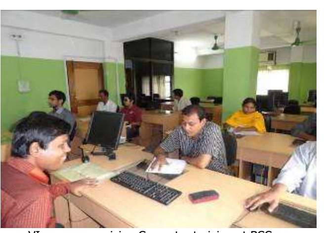
VI persons receiving Computer training at BCC