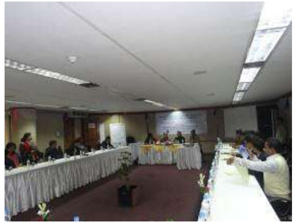
Workshop on Making National Budget Work for the Children