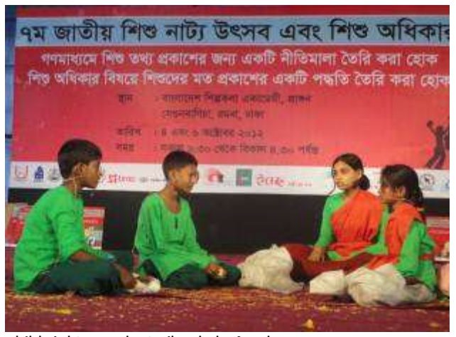
Children performing theatre observing child rights week at silpa kala Academy