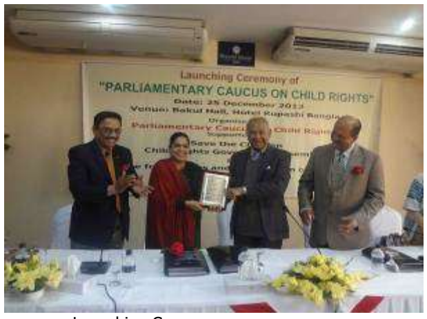
Launching Ceremony on "Parliamentary Caucus on Child Rights"