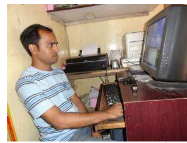
Accessible Cyber Cafe