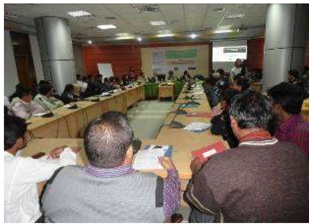
A roundtable on ICT rights