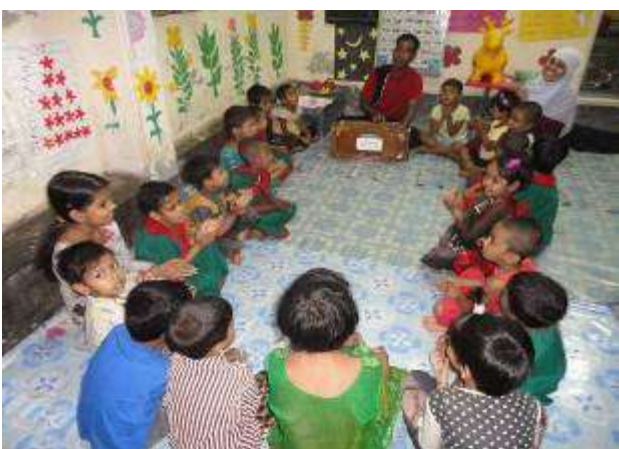
Pre-school centre operated by the project