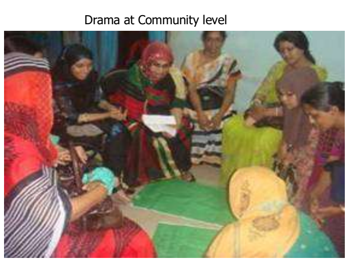
Conducting School Teachers Training on Disability Issue