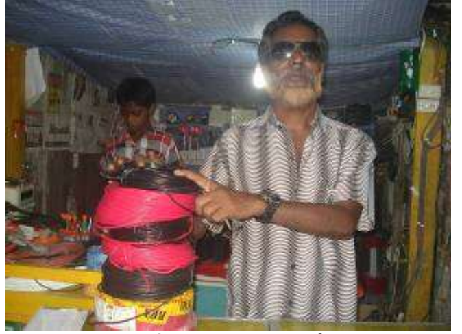
Capacity building of Self-help group