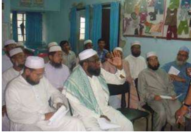
Disability Orientation to Religious Leaders