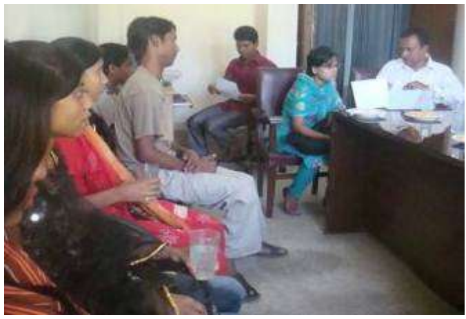
Advocacy Activity with BANGLADESH SHISHU ACADEMY