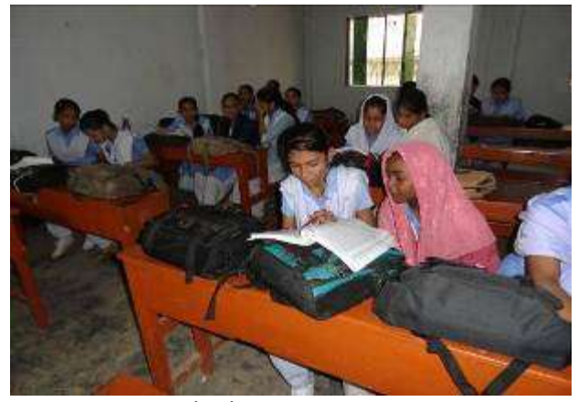
Children with Disabilities are studying at mainstream schools