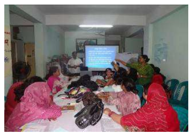
Teachers training on Inclusive Education