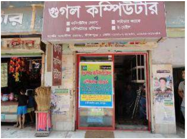
An accessible Café at Chandpur