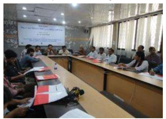
Pre budget analysis conference