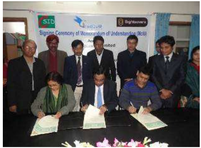
MoU signing ceremony with Creative IT Limited