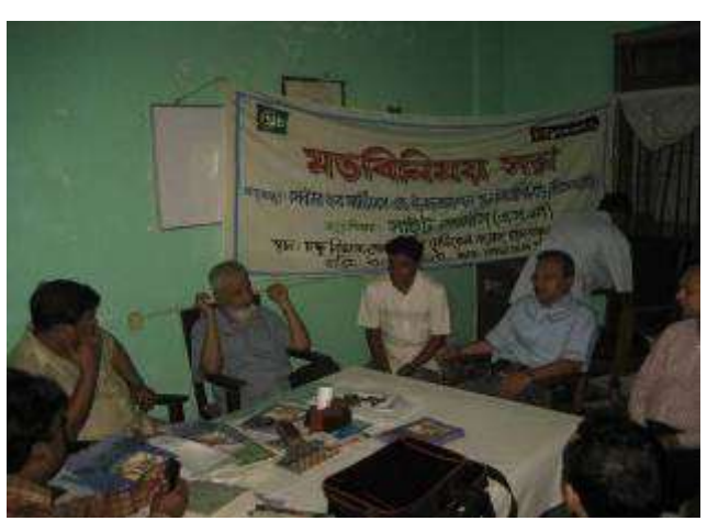
Review meeting with SBMCH authority