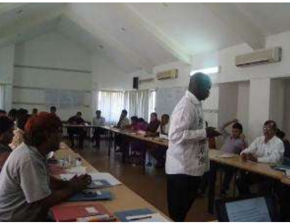
Capacity Building workshop on Investment in Children