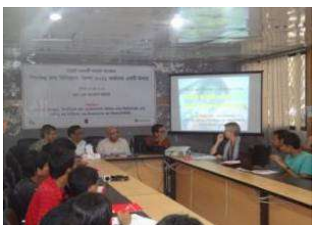
Post budget analysis conference